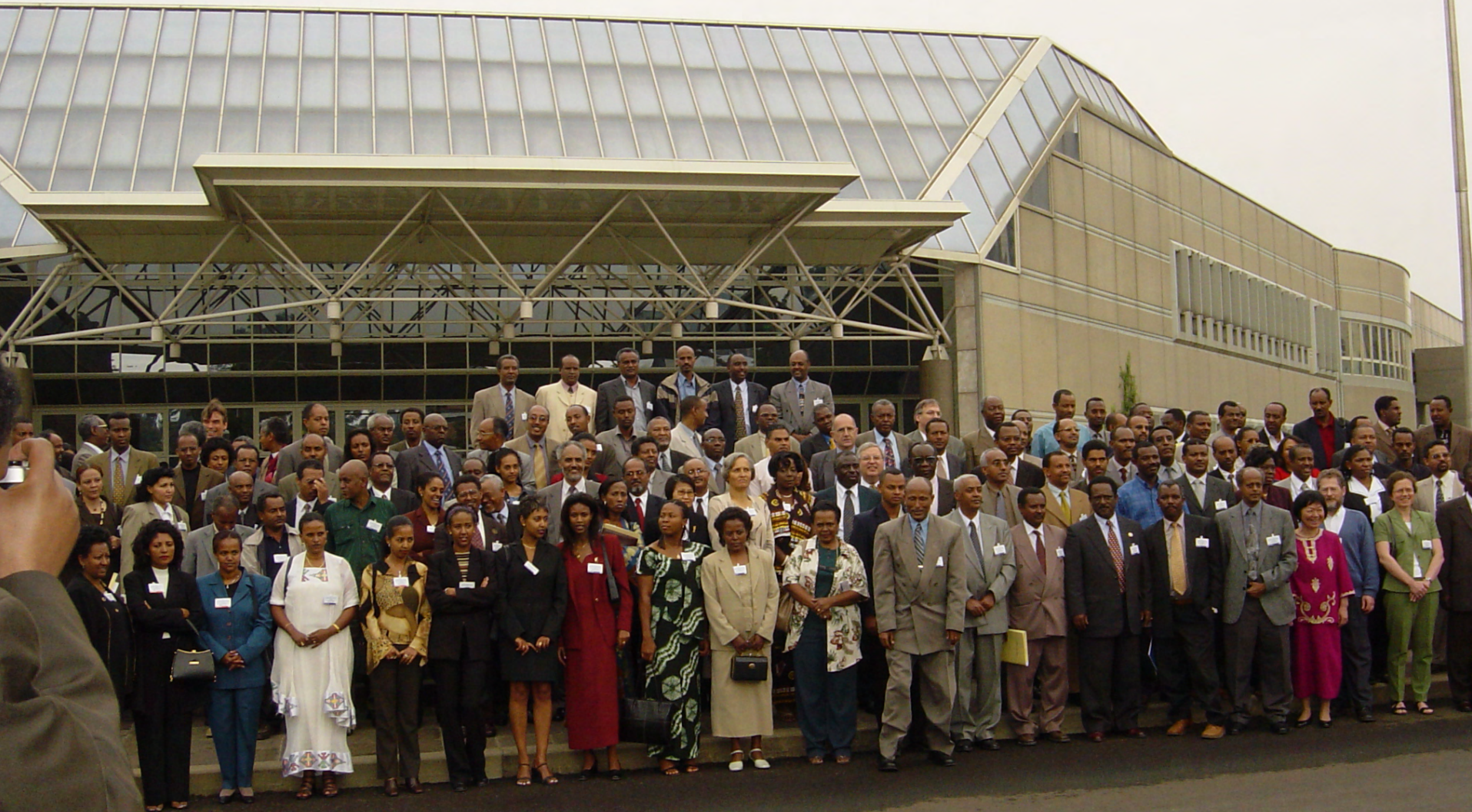
PABIN Meeting April 2003