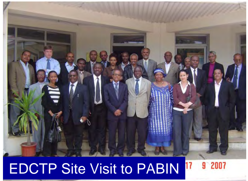
EDCTP Site Visit to PABIN 17 9 2007