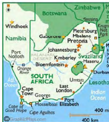
★ Capital City ★ Regional Capital City ● Significant City ● Important City - Town □ Attraction - Landmark □ River ▲ Highest Point