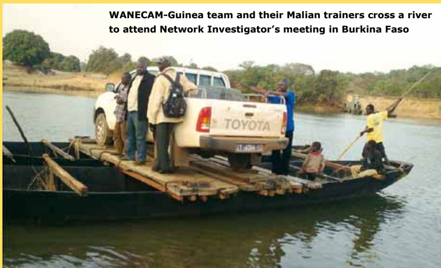
WANECAM-Guinea team and their Malian trainers cross a river to attend Network Investigator's meeting in Burkina Faso

Overall, it is expected that these studies will generate important safety and efficacy data on the repetitive usage of the two new ACTs under investigation (i.e. pyronaridine-artesunate and dihydroartemisinin-piperazine) that will allow for a better estimate of their added value compared to the ACTs currently on the market. DHAPQ treatment was recently included in the WHO list of recommended ACTs, and it is expected that pyronaridine-artesunate may also be added to the recommended ACTs in the near future.