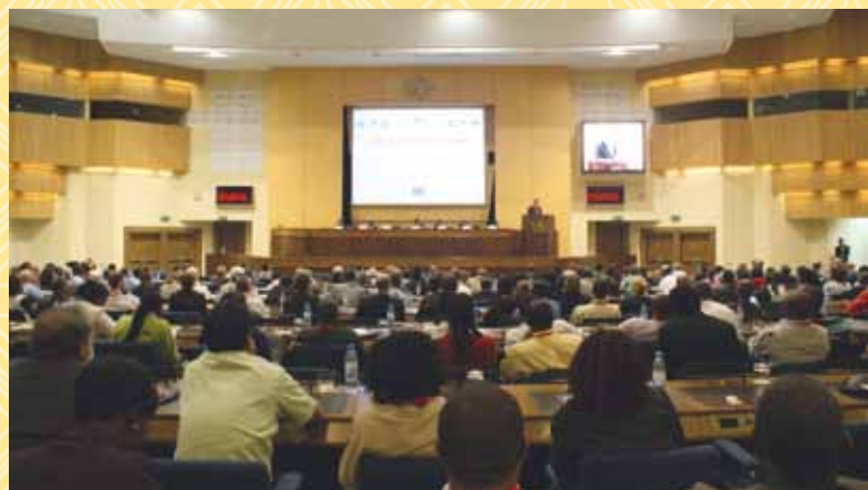
Official opening ceremony of the Sixth EDCTP Forum, 9 October 2011 in Addis Ababa, Ethiopia.

A summary of the Sixth EDCTP Forum proceedings will be published in January 2012. Please visit the Sixth Forum blog at www.edctpforum.org/sixthforumblog for more information and summaries of sessions. Presentations are available for download at www.edctpforum.org .