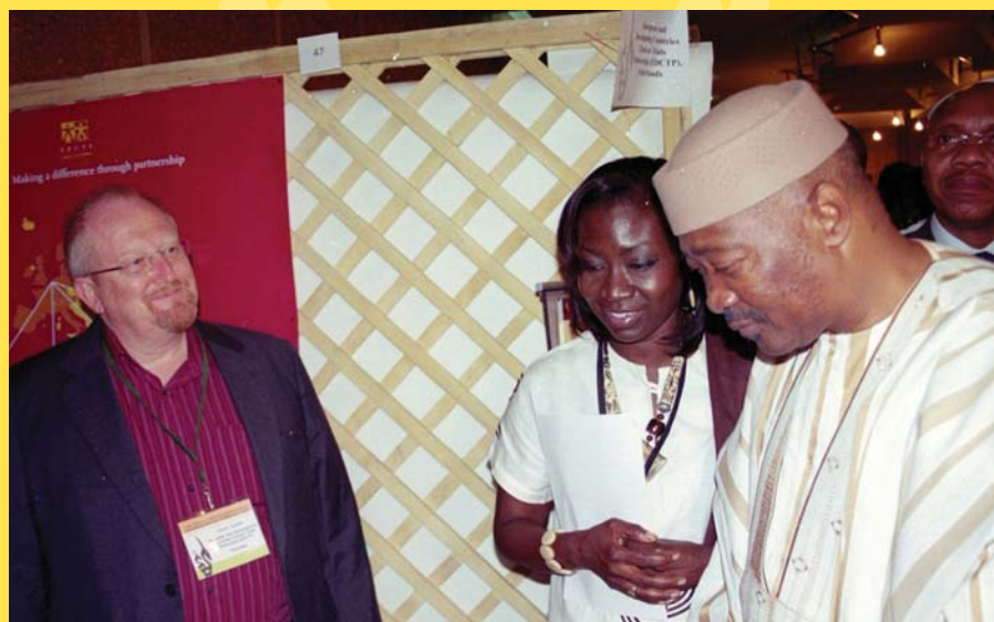
His Excellency the president of Mali, Amadou Toumani Touré, at the EDCTP stand

EDCTP will continue the Member State visits this year.