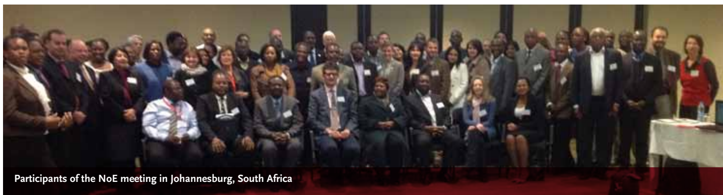
Participants of the NoE meeting in Johannesburg, South Africa

African Community (EAC), the Southern African Development Community (SADC) and their European partners. Agreement on research and capacity building priorities was achieved for the different diseases and interventions.