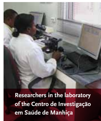
Researchers in the laboratory of the Centro de Investigação em Saúde de Manhica

were amongst the EDCTP-funded projects that were evaluated. EDCTP funding helped improve research oversight in the country. Throughout its existence and with the help of EDCTP funding, the National Ethics Committee of Mozambique has helped in the formation and endorsement of seven Institutional Review Boards.