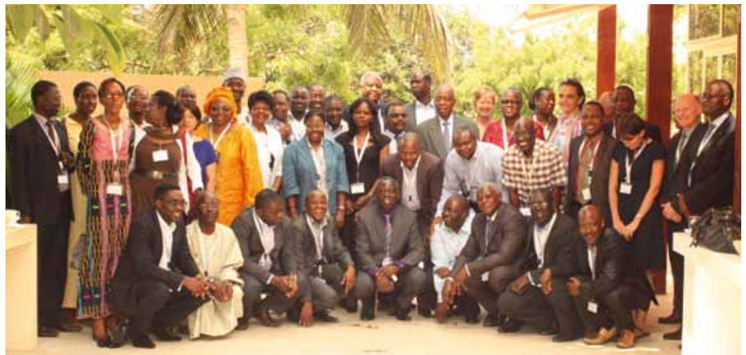
Participants of the NoE meeting in Dakar, Senegal

WANETAM, CANTAM and their partners on the priority areas of research to pursue under EDCTP2.