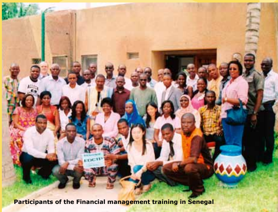
Participants of the Financial management training in Senegal

EDCTP organised a financial management workshop for finance staff of EDCTP grantee institutions in West and Central Africa in Dakar, Senegal from 10-15 September 2012. The objective of this workshop was to provide participants with the required knowledge and financial management skills to improve financial accountability and transparency at their respective institutions.