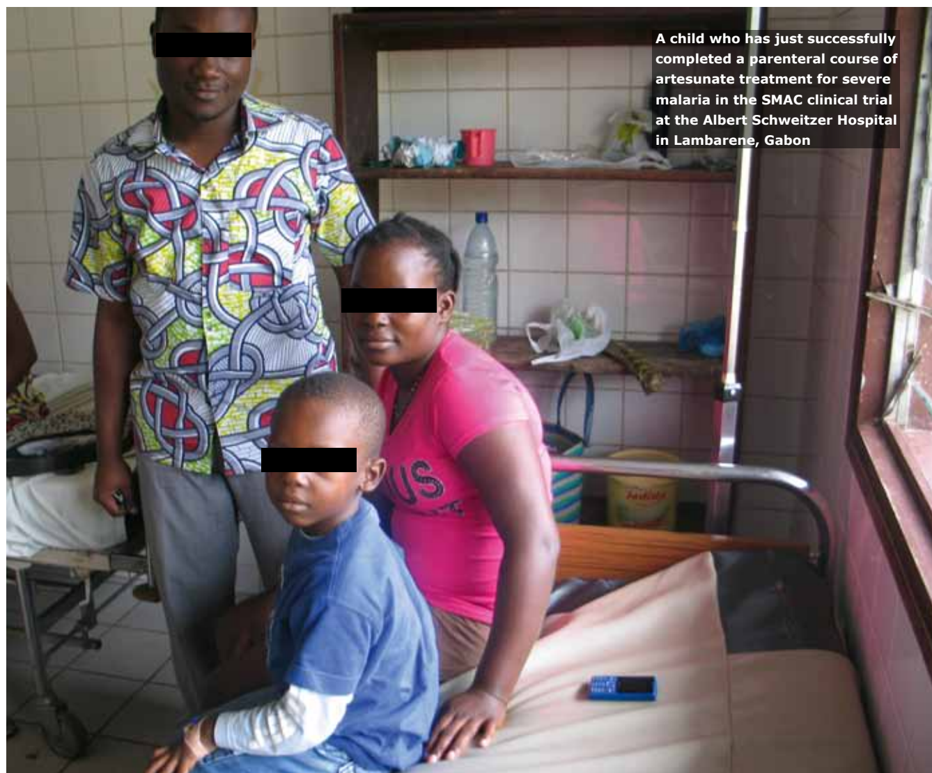
A child who has just successfully completed a parenteral course of artesunate treatment for severe malaria in the SMAC clinical trial at the Albert Schweitzer Hospital in Lambarene, Gabon

The earlier SMAC phase II multicentre clinical trial, also coordinated by Prof. Kremsner, demonstrated that a shorter anti-malaria treatment is equally effective as the longer standard regimen in treating children with severe malaria. It was shown that three doses over two days of the drug artesunate delivered intravenously are as effective as five doses over three days. The results for the SMAC studies on artesunate treatment for severe malaria were published online in the Journal of Infectious Diseases in December 2011 (doi: 10.1093/infdis/jir724).