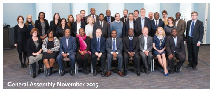
General Assembly November 2015