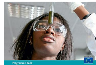
Download programme booklet