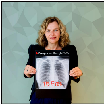
Ms Edith Schippers, Min of Health.