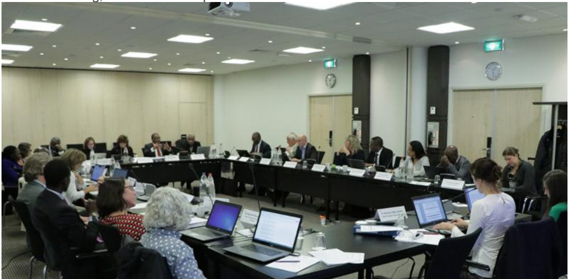
EDCTP Scientific Advisory Committee, 15 September 2017