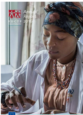
Annual Report 2016