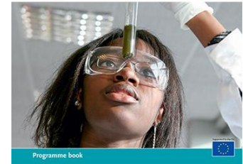
Download programme booklet

The EDCTP comprehensive fellowship scheme supports individual researchers in sub-Saharan Africa and promotes career development as well as scientific leadership and excellence. During the first and second programmes of EDCTP (up to and including 2016), 102 fellowships have been awarded.