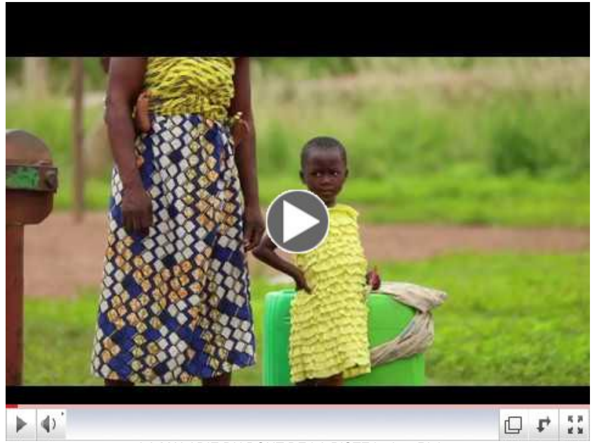
LA MALADIE DU BOUT DE LA PISTE by Luc Riolon

AFREENET | Project launch | 27-28 March 2018 | AFREENET, an EDCTP-funded project to strengthen national ethics committees in francophone Africa had its kick-off meeting in Abidjan, Côte d'Ivoire on 27-28 March 2018. AFREENET, coordinated by the Pasteur Institut (Paris, France), brings together the Research Ethics Committees of Côte d'Ivoire, Guinea and Benin with the aim of strengthening their role and their operating conditions. Moreover, AFREENET aims to create an exchange platform and a network of excellence between National Ethics Committees, within the consortium, and in Africa, for researchers and research institutes, regulators and drug agencies, as well as international organizations. More EDCTP-funded projects on research ethics