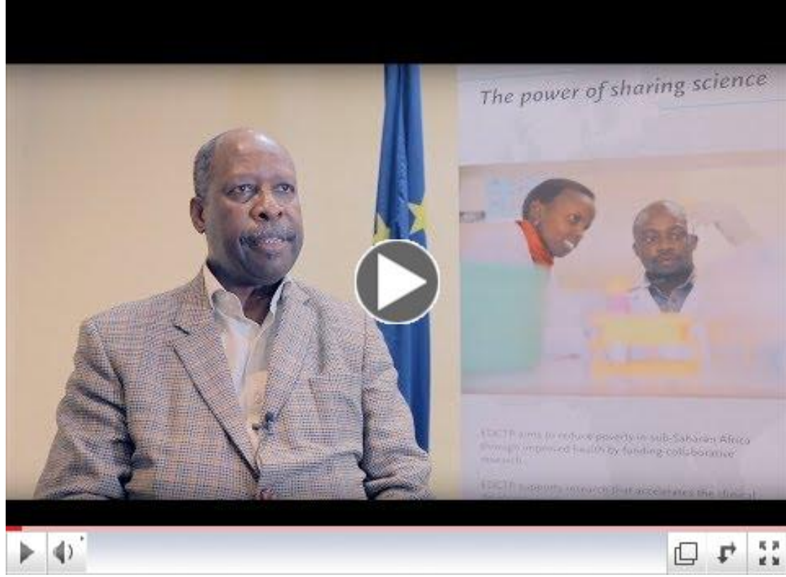
EDCTP Alumni Network launch