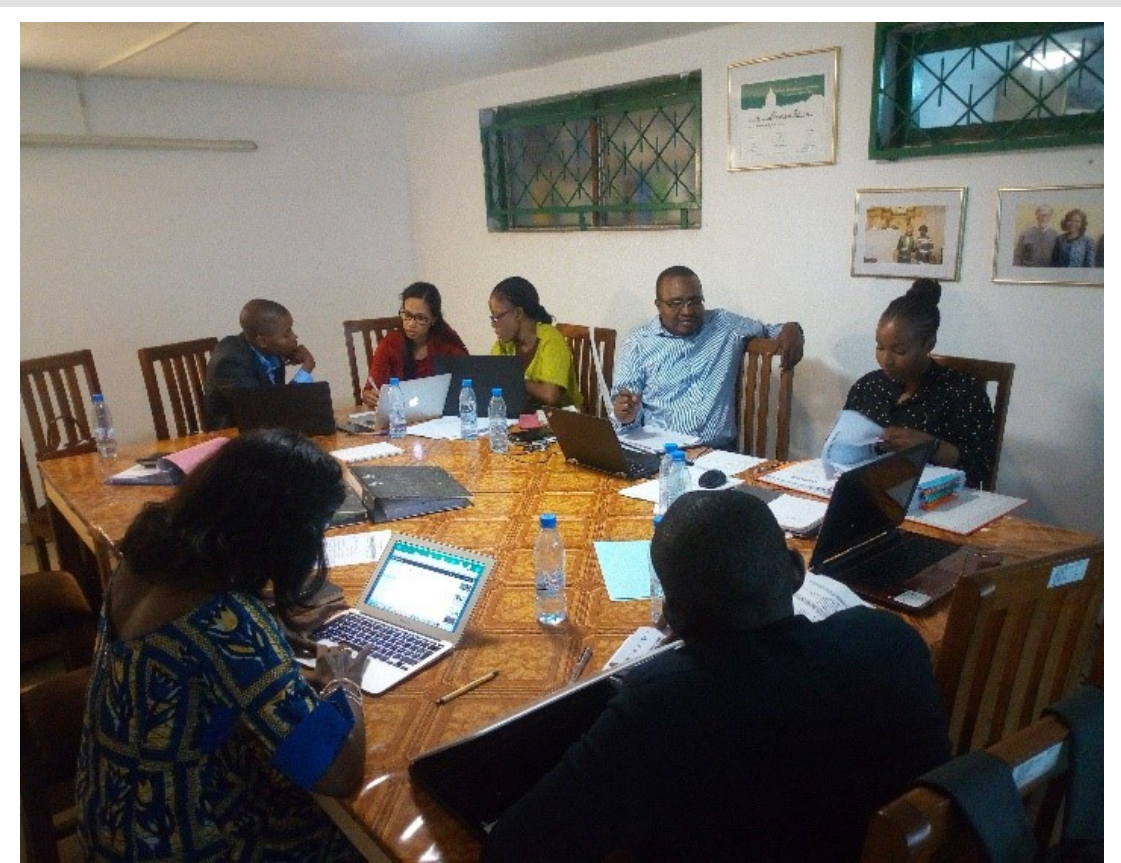
CANTAM project team and EDCTP Officers.

Institut Pasteur | International Network symposium | 15-16 November 2018