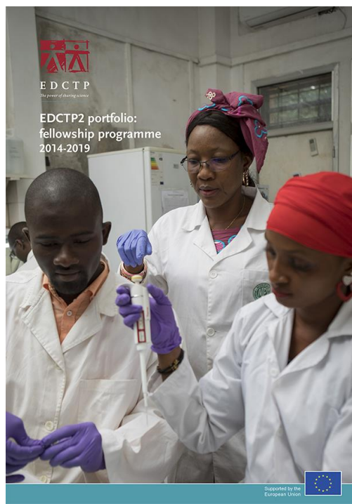
EDCTP fellowships 2014-2019 (TMA grants)

More information also in our public grants platform - improved search!