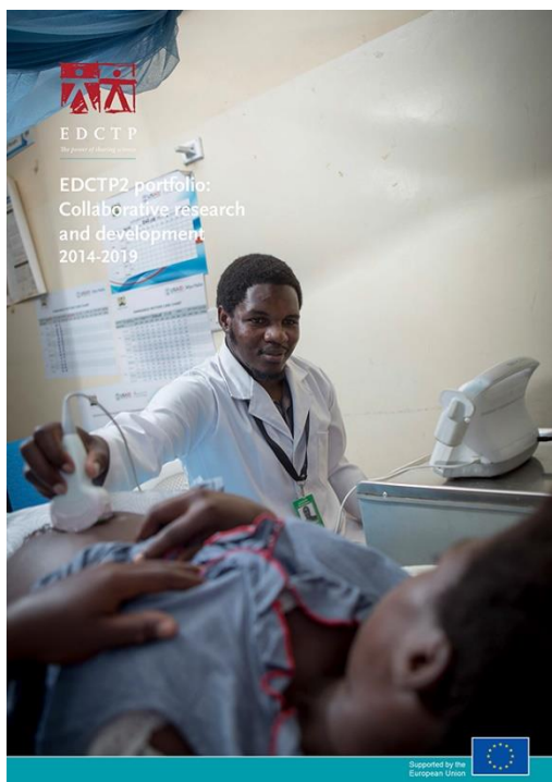
EDCTP Collaborative R&D projects 2014-2019 (RIA grants)