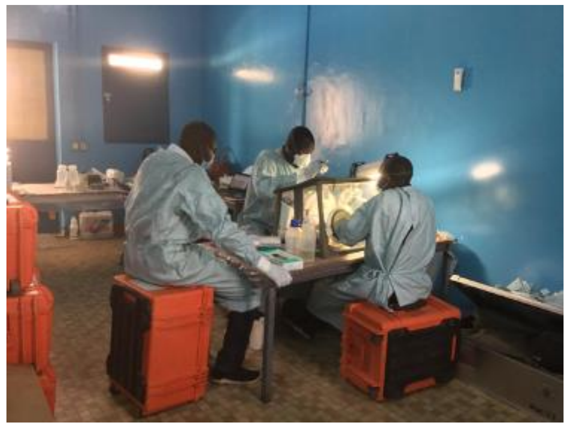
Inactivation of samples