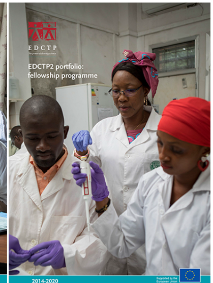
Collaborative clinical R&D online