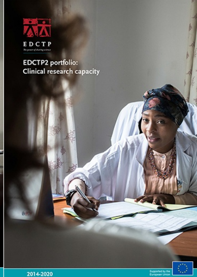
Clinical research capacity PDF