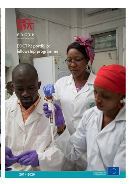
Collaborative clinical R&D online