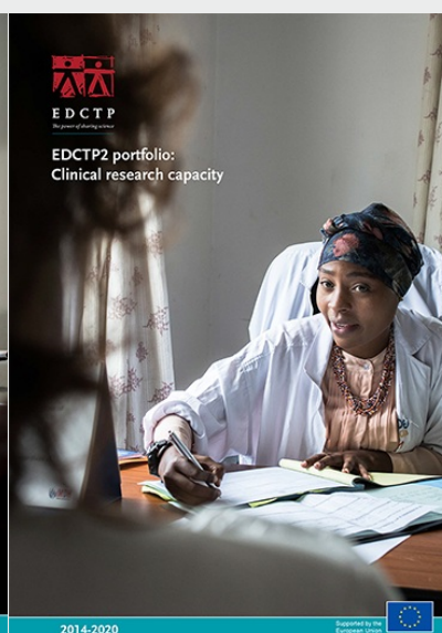
Clinical research capacity PDF