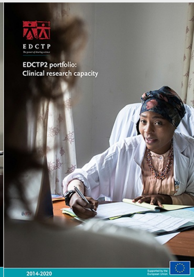
Clinical research capacity PDF