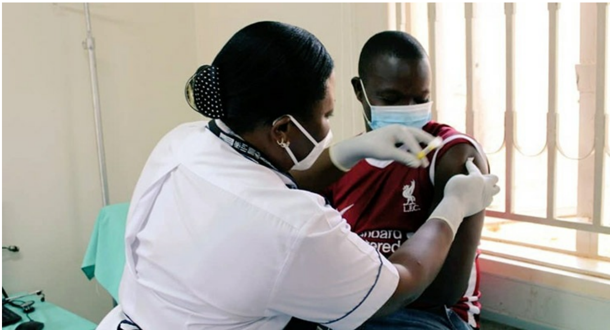
The first PrEPVacc volunteer participant receives an injection at the Masaka site of the MRC/UVRI and LSHTM Uganda Research Unit, on Tuesday 15 December 2020.

The EDCTP-funded PrEPVacc HIV prevention study has stopped its experimental vaccine regimens as there is little or no chance of the trial demonstrating vaccine efficacy in preventing HIV acquisition. The study has conducted experimental vaccine regimens and a new form of oral pre-exposure prophylaxis (PrEP) in 1,500 participants from East and Southern Africa. The decision to stop vaccinations immediately was based on the recommendations of its independent data monitoring committee. The committee has recommended that the oral PrEP component of the study continue to completion. EDCTP commends the PrEPVacc consortium for their excellent management of this complex trial. We continue to work with the consortium to support the study in generating and analysing the data for future vaccine development. We thank all the trial participants for their cooperation and support to this study.