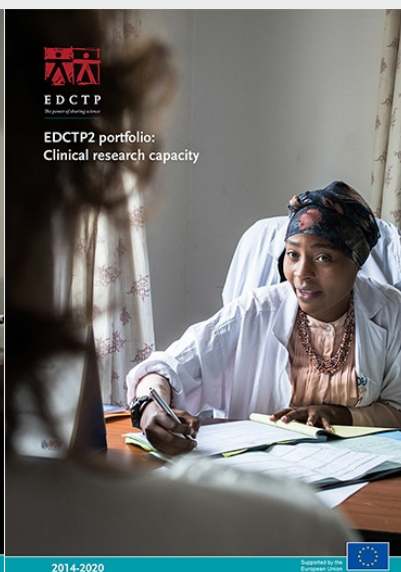
Clinical research capacity PDF