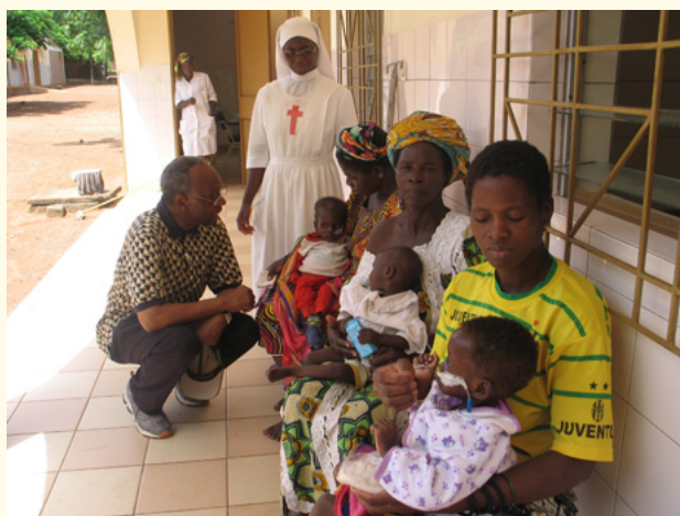
EDCTP High Representative, Dr Pascoal Mocumbi, talking to study patients at Nanoro District Health Center, Burkina Faso