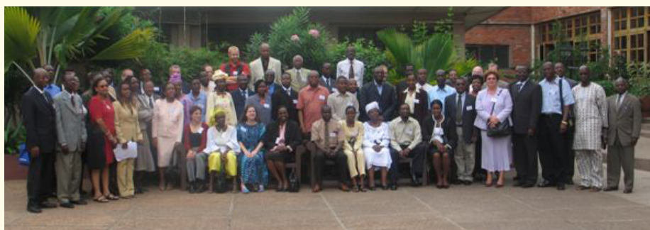
Participants at the first Afro Vaccine Regulator's Forum in Accra, Ghana

The forum brought together 80 participants from 25 countries the majority of them being African regulators involved either in the ethical or regulatory review of clinical trials applications or related functions in the regulatory pathway of vaccine products. The forum was also attended by researchers, product developers and regulatory experts from the European Medicines Agency (EMA) and