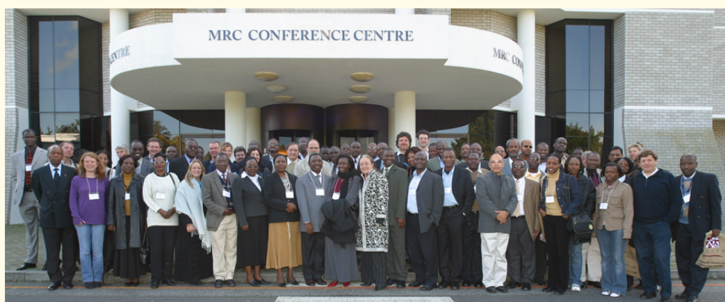
Participants at the 2006 EDCTP investigators' meeting, South Africa

At this meeting participants shared experiences and exchanged information on existing projects, facilitated the establishment of South-South links (e.g. mentorship programmes, nodes of excellence, and sharing of facilities and expertise), explored common grounds of interest such as possibilities of joint grant applications, proposed a direction of research agenda to EDCTP as determined by the experiences from the ongoing projects, discussed regulatory issues, discussed the use of the established EDCTP clinical trial registry, and role of African institutions in clinical trials sponsorship.