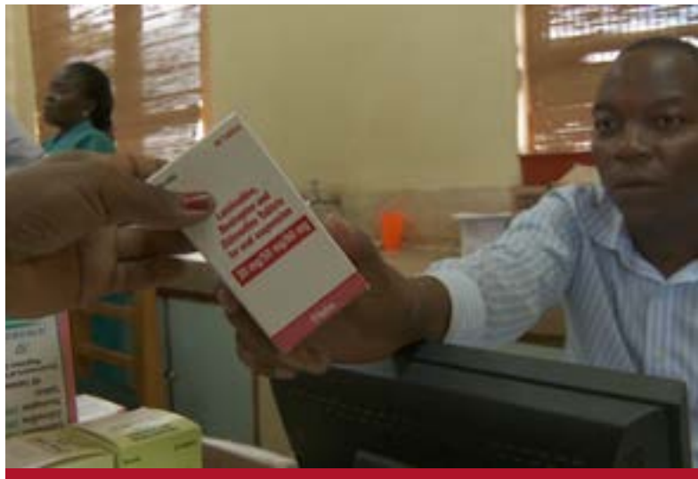
Tablets being delivered to participant of the CHAPAS clinical study.

The findings of CHAPAS-I have made it manageable for caregivers to administer the correct dosage and easy for children to take. Being scored and layered these tablets can easily be snapped in half allowing use within a simple weight band dosing table that ensures children receive the correct dose for their weight. The tablets have the added advantage of being crushable and dispersible in water, making them accessible for the treatment of infants as young as 3 months.