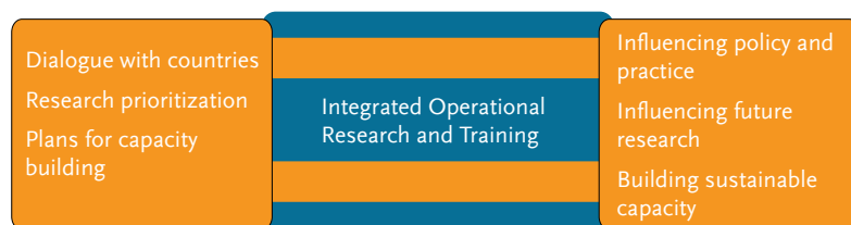
Diagram of SORT IT approach from Dr Lienhardt's presentation

There is also a need to move from tools to strategies (from evaluation to impact), as in the implementation study for the Xpert MTB/RIF assay in Brazil. This was a stepped-wedged cluster randomised clinical trial, enrolling approximately 8 million people in more than 200 clinics to assess replacing the standard two-smear test with the Xpert MTB/RIF assay