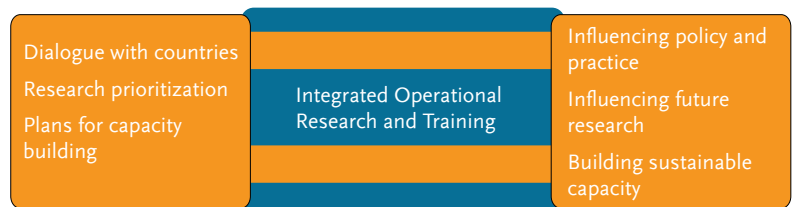
Diagram of SORT IT approach from Dr Lienhardt's presentation

There is also a need to move from tools to strategies (from evaluation to impact), as in the implementation study for the Xpert MTB/RIF assay in Brazil. This was a stepped-wedged cluster randomised clinical trial, enrolling approximately 8 million people in more than 200 clinics to assess replacing the standard two-smear test with the Xpert MTB/RIF assay