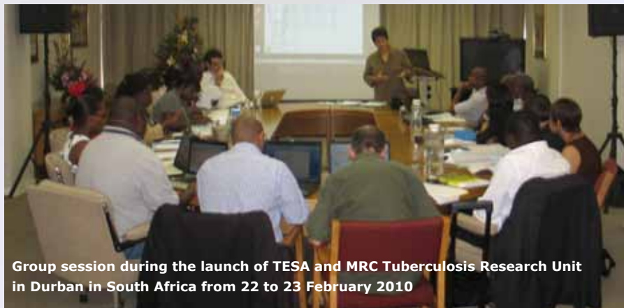
Group session during the launch of TESA and MRC Tuberculosis Research Unit in Durban in South Africa from 22 to 23 February 2010