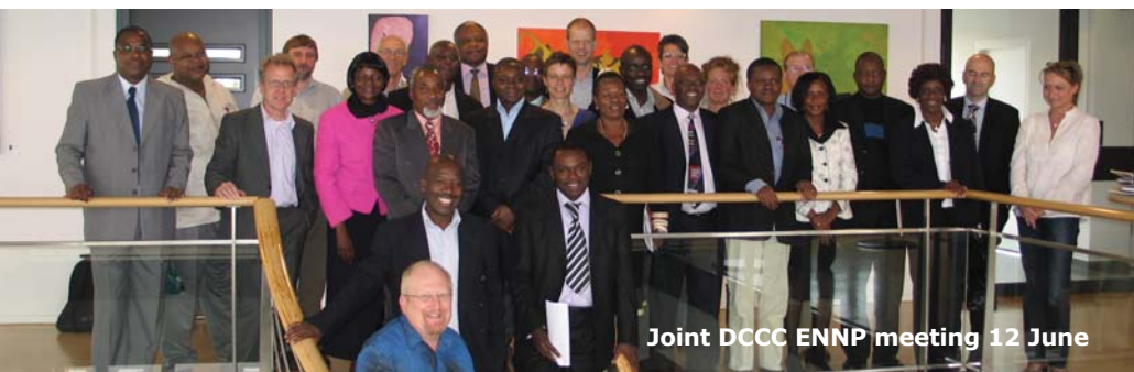
Joint DCCC ENNP meeting 12 June

Another highlight of the meeting was the decision to hold a Fifth EDCTP Forum in Arusha, Tanzania in October 2009. Also, GA members were invited to join the EDCTP team on their site visits to develop advocacy between the Member States and African partners.