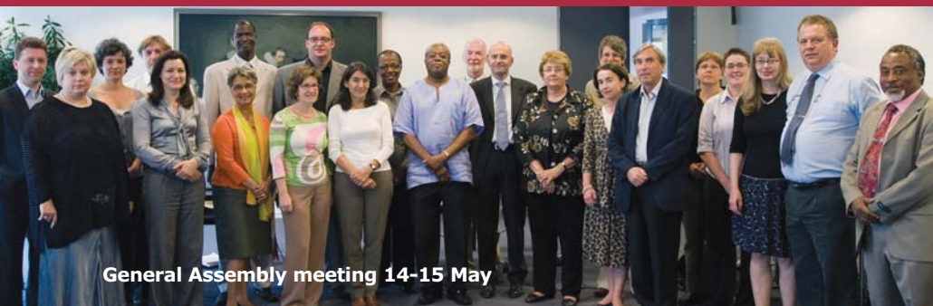
General Assembly meeting 14-15 May