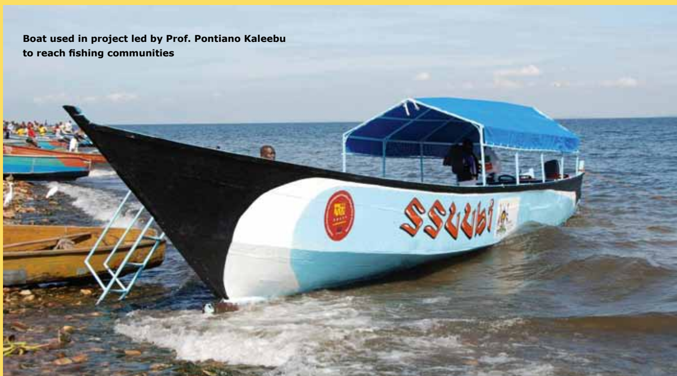
Boat used in project led by Prof. Pontiano Kaleebu to reach fishing communities

See also the recent EDCTP video on some HIV projects on YouTube channel EDCTP media ( www.youtube.com/edctpmedia ).