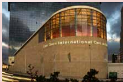
The Cape Town International Convention Centre, venue of the High-level meeting on EDCTP-II

The South African Department for Science & Technology, the European Commission and EDCTP are jointly organising the conference on the occasion of the 15th anniversary of the signing of the Science & Technology cooperation agreement between the European Union and South Africa. There will also be visits to clinical trial sites or institutions in the Cape Town area which are beneficiaries of EDCTP funding.