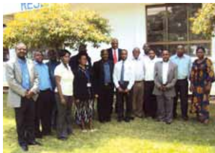
Participants of a meeting between EACCR and EDCTP at KCRI during a site visit to Tanzania on 16 April 2012