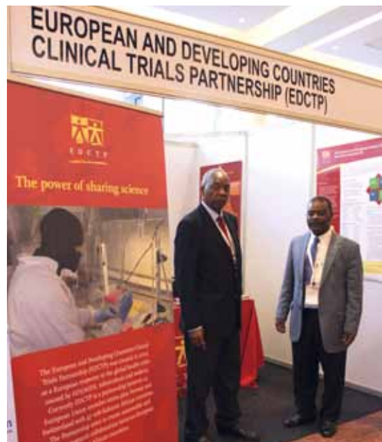
Dr Pascoal Mocumbi, EDCTP High Representative, and Dr Michael Makanga, Head of the EDCTP Africa Office, at the Forum 2012

as panel members in two sessions where the EDCTP programme model and individual project case studies were highlighted. EDCTP activities were also exhibited at the Market Place of the Forum 2012.