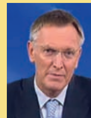
Dr Janez Potočnik, EU Commissioner for Science and Research

European Union Commissioner for Science and Research Dr Janez Potočnik addressed the audience at the opening ceremony through a video message. The EU Commissioner commented on the progress of research coordination through EDCTP over the years, and referring to the independent evaluation of the EDCTP programme conducted in 2006, he remarks: "Because I have always believed in the noble purpose of this initiative, I decided to continue ... Now, almost three years later, it is paying off."