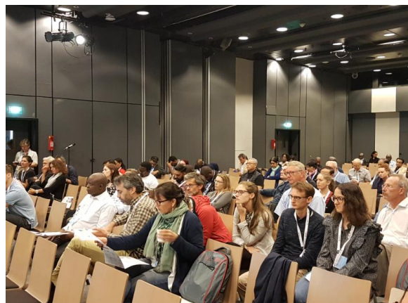
Audience at the symposium