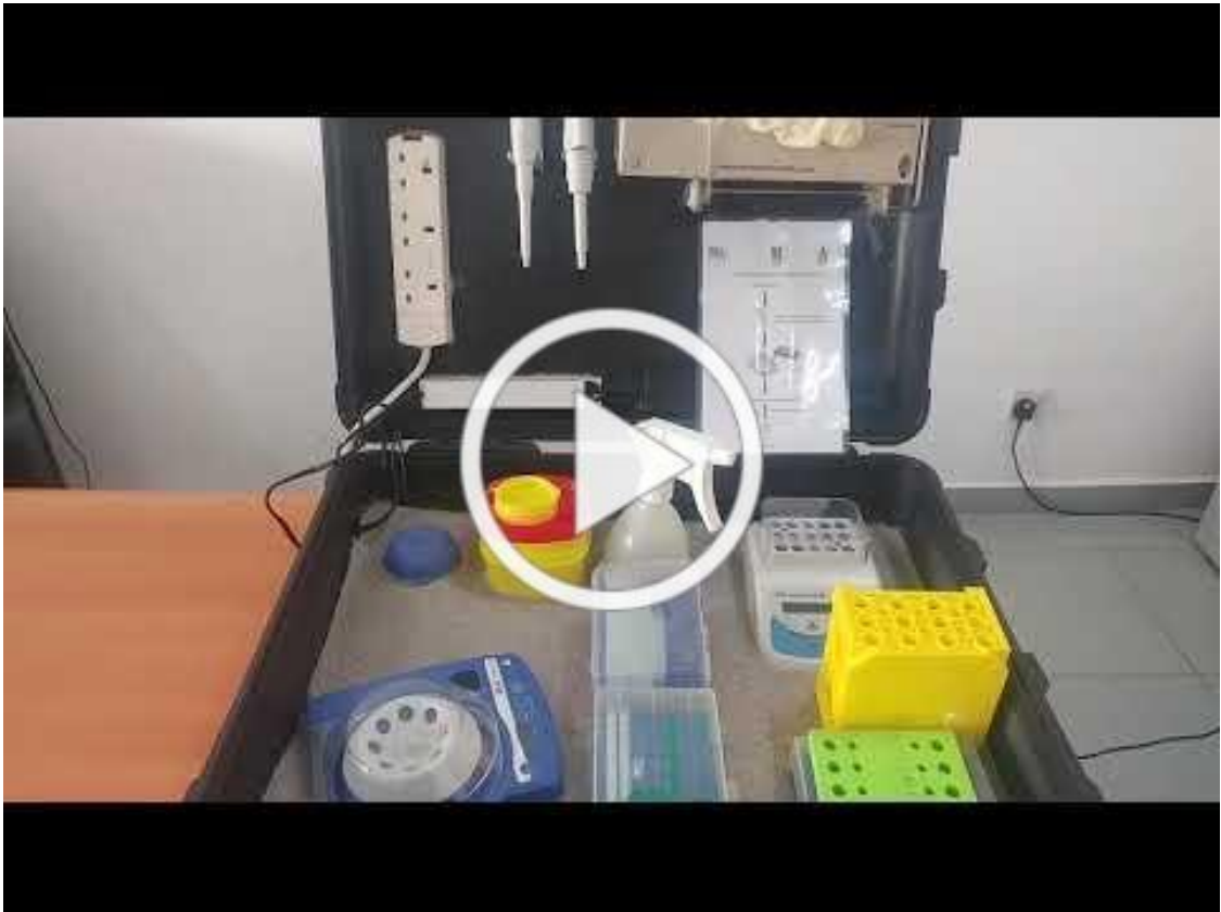
Field-deployable recombinase polymerase amplification assay for rapid detection of Buruli ulcer