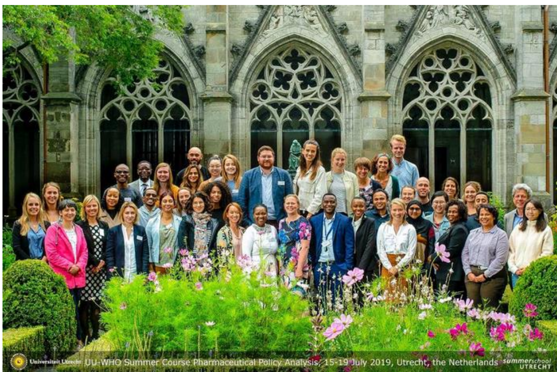
Fellows attending the Utrecht University WHO Summer School on Pharmaceutical Policy Analysis 15-19 July 2019, Utrecht, The Netherlands

* Good Manufacturing Practices ** Massive Open Online Course