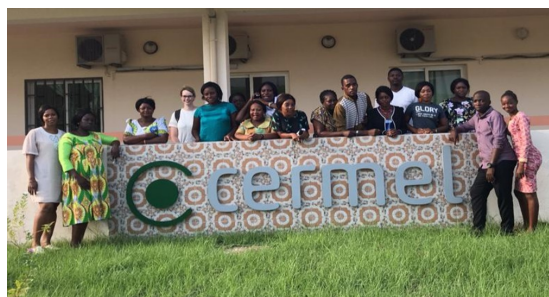
FreeBILy team Gabon