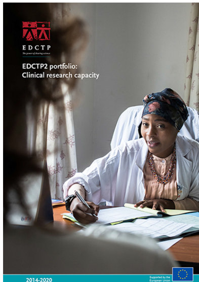
Clinical research capacity PDF