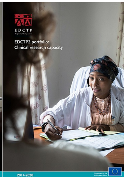
Clinical research capacity PDF