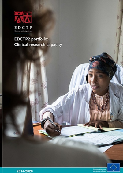
Clinical research capacity PDF