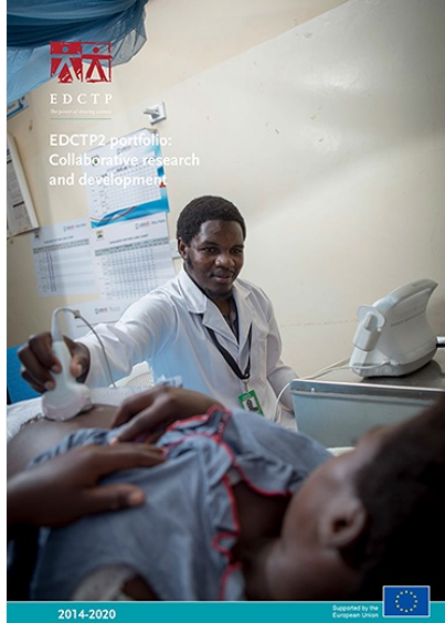
Collaborative clinical R&D online