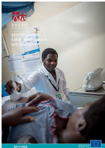
Collaborative clinical R&D online