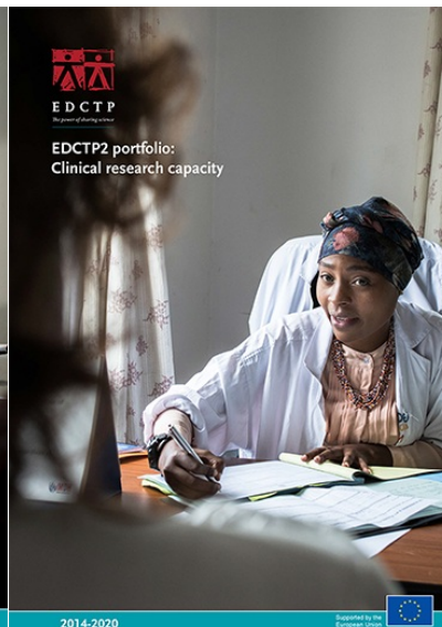
Clinical research capacity PDF