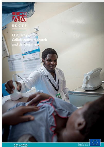
Collaborative clinical R&D online