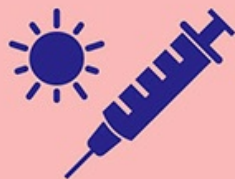
Malaria Vaccine (Given Before Rainy Season)

Seasonal drug-vaccine combination sustains dramatically superior malaria protection over 5 years.