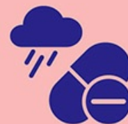
Antimalarial Drugs (SMC) (Given During Rainy Season)