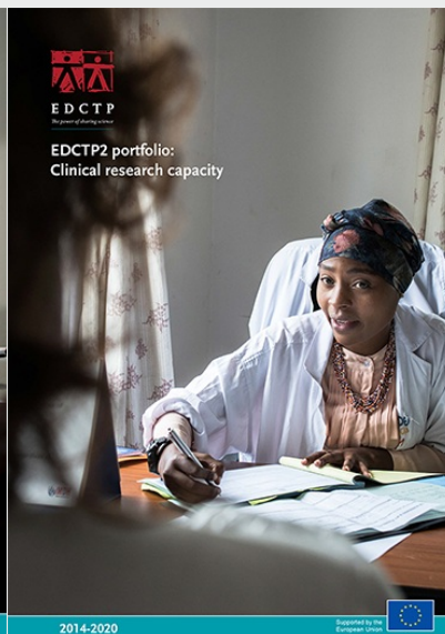
Clinical research capacity PDF